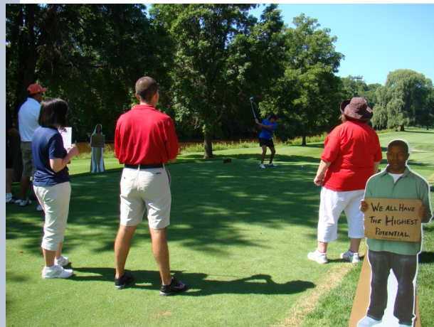
Schreiber golfers, partners, and CASA staff watch as a golfer attempts to navigate through hole #12. CASA “kids” look on.